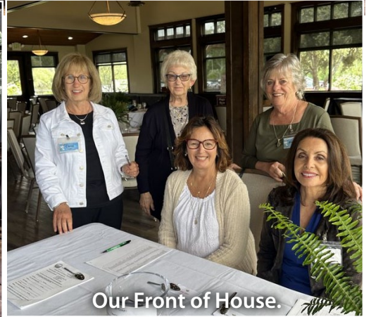
Our Front of House.