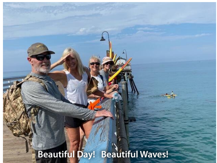
Beautiful Day! Beautiful Waves!