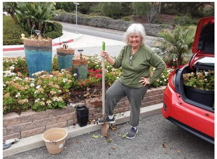
Gardeners at work retrieving donated plants for the Fall Plant Sale October 14.

It's time to make plans for the fall Plant Sale. Mark your calendars for the morning of FRIDAY, OCTOBER 13 , from 9 am-noon. It's a nice time to catch up with garden club friends while you help set up and price plants, etc. Then join us anytime from 8 am to 2 pm on Saturday, October 14, to assist customers during the sale and help wrap up afterwards. Join us any time, stay as long as you like, we need your help! We will welcome volunteer sign ups at our "back from summer" meeting on September 6.