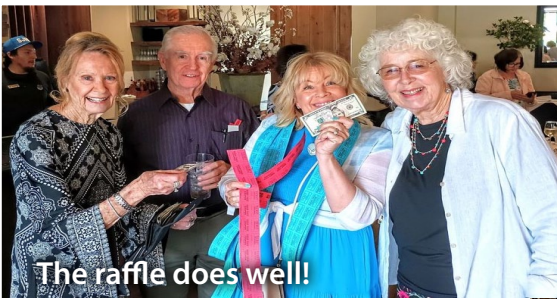
The raffle does well!