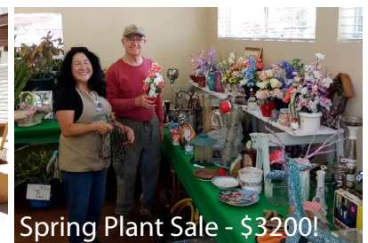
Spring Plant Sale - $3200!