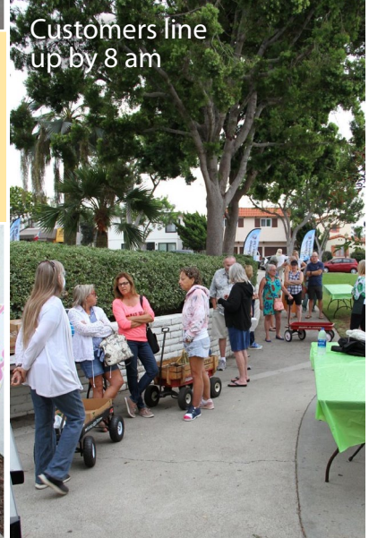
Customers line up by 8 am