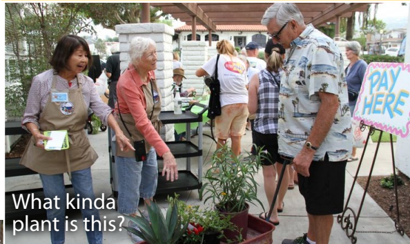
What kinda plant is this?