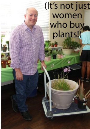
(It's not just women who buy plants!)