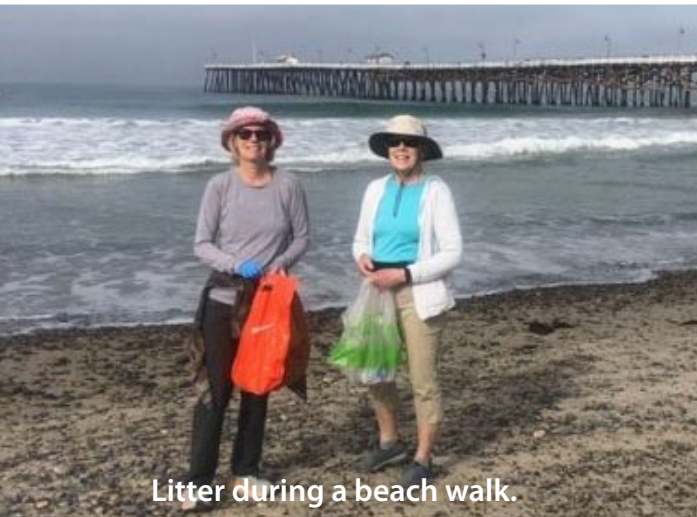
Litter during a beach walk.