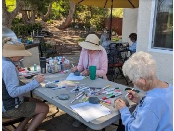
Club members and friends painting the rock labels for our 2022 Garden Tour.