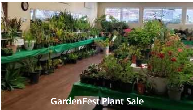
GardenFest Plant Sale