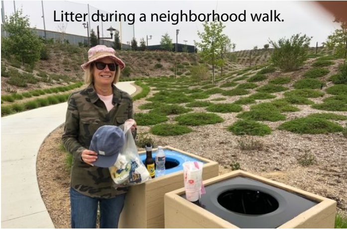
Litter during a neighborhood walk.

Here's a reminder that "Plalking" is always a good idea — that's "Picking Up Litter While Walking." Unfortunately, there never seems to be a time where you can walk and find NO litter, but if people engaged in Plalking, the Zero Litter Walk could become a reality! C'mon, bend over and pick it up! It won't bite.