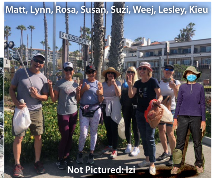
Not Pictured: Izi