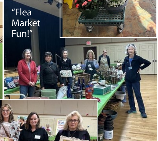
"Flea Market Fun!"