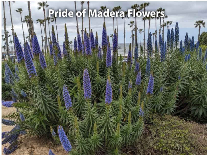
Pride of Madera Flowers

Come and help us control the weeds so that our native plants will thrive and show off their beautiful blooms. Many hands make lighter work. Thank you for all of your continued help and support.