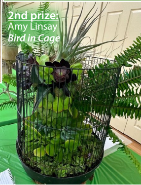
2nd prize: Amy Lindsay Bird in Cage