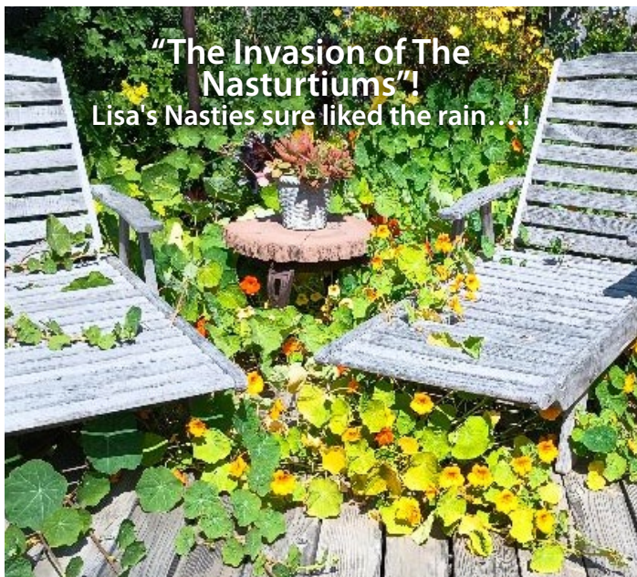
"The Invasion of The Nasturtiums"! Lisa's Nasties sure liked the rain....!