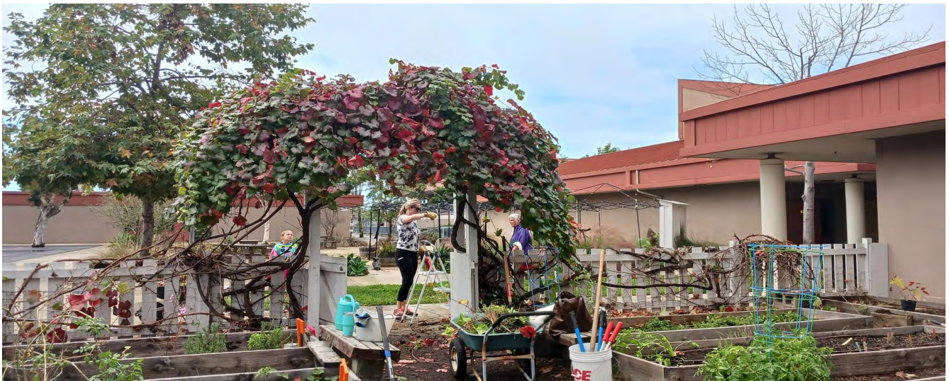
School Gardening program with Marblehead Elementary.