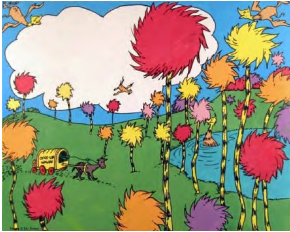
Truffula Trees ( Truffula arborealis )