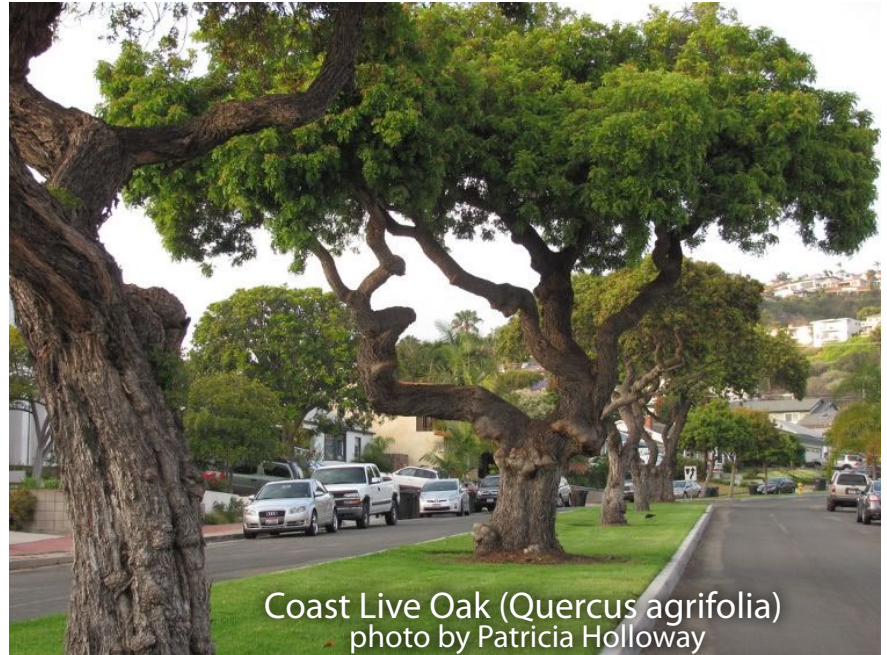
Coast Live Oak ( Quercus agrifolia)