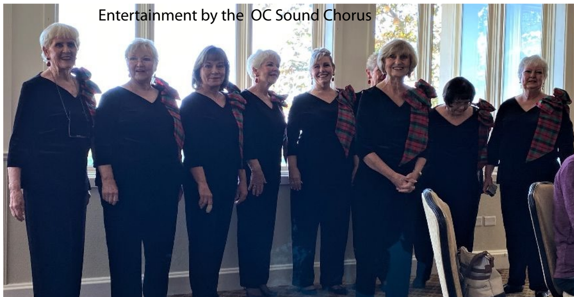
Entertainment by the OC Sound Chorus