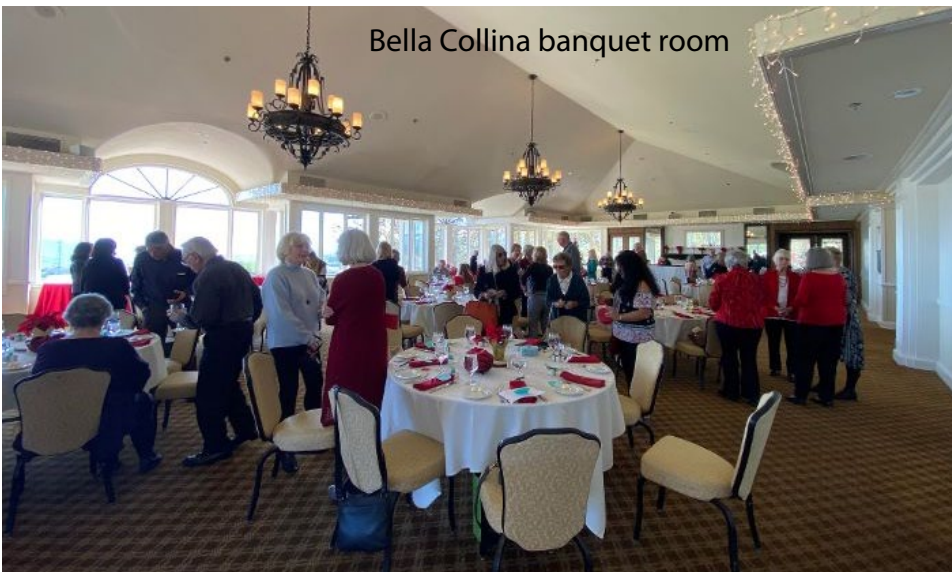
Bella Collina banquet room