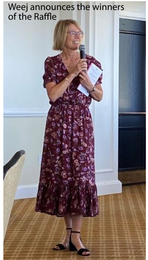
Weej announces the winners of the Raffle