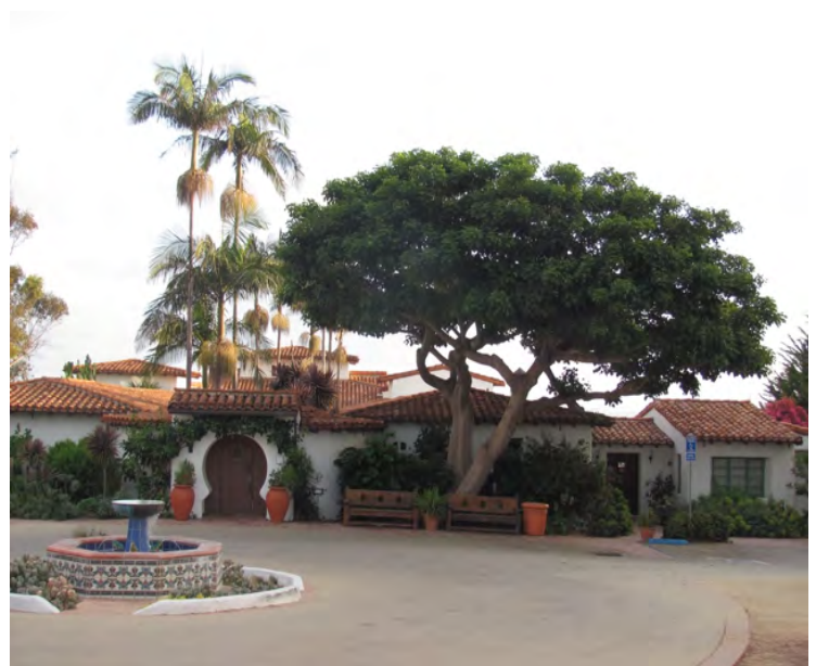
Coral Trees have bright red tubular flowers when in bloom. Photo taken May 27, 2013

1927 Ole Hanson's passion for gardens played a significant role in the selection of the official tree of the City of San Clemente. He planted a large Coral Tree at the entrance to Casa Romantica, imported from Africa at his request. After propagating the tree throughout the city, its colorful boughs are now an important part of local landscapes.