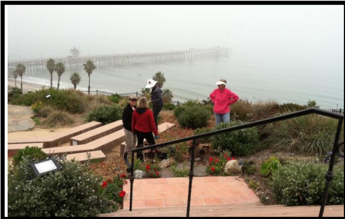
Civic Beautification Volunteers enjoy a Thursday morning tending the Gardens.