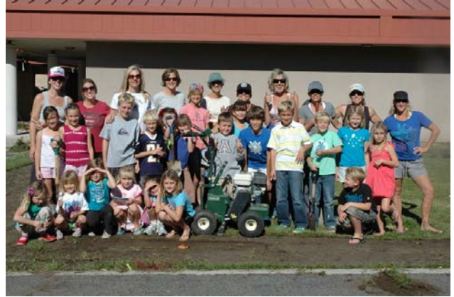
1 st Workday - Kokua Garden Crew