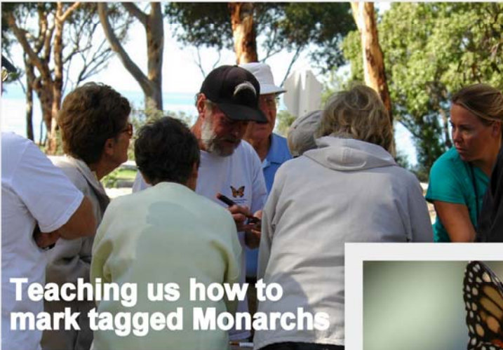
Teaching us how to mark tagged Monarchs